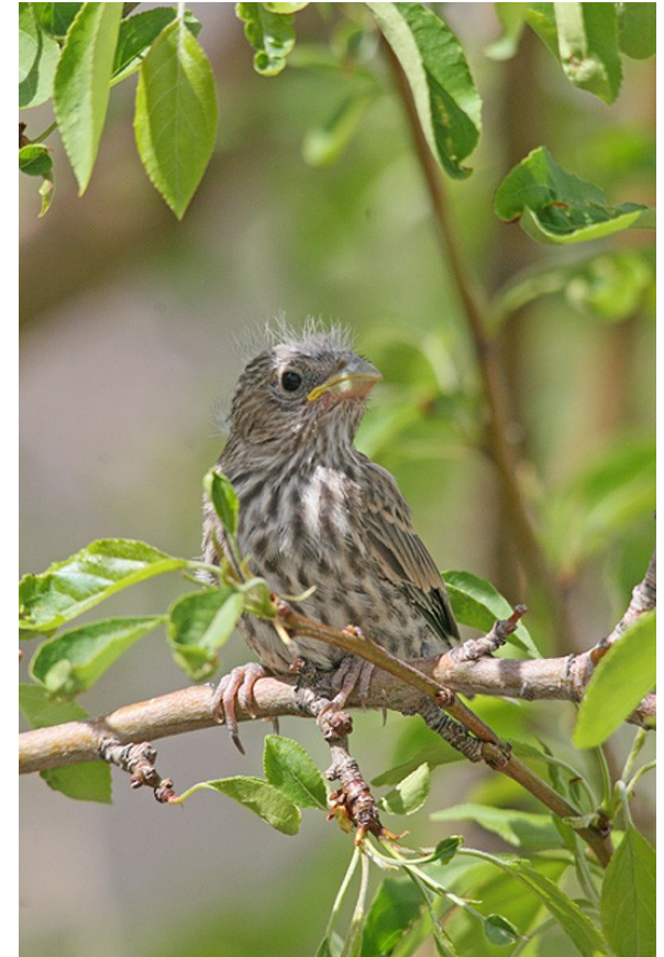
House Finch fledgling, Loveland, Colorado

I hope you will enjoy One Woman's Wanderings .